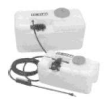
Hardi 12V 25ltr powered Spray unit