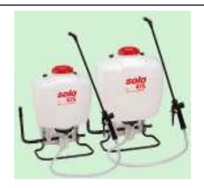
Solo hand operated backpack spray unit